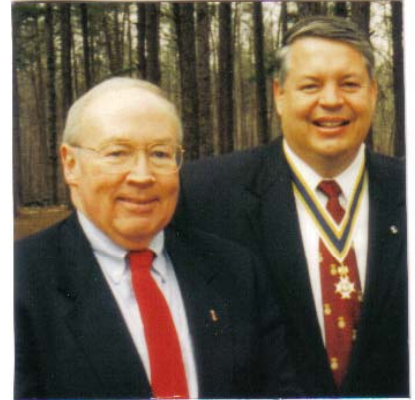
2004 CAR Convention